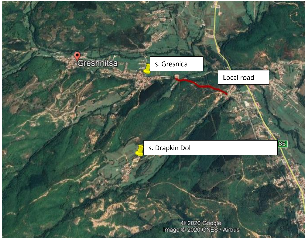
Figure 3 Current condition of the project site local road connecting s. Gresnica - Dlapkin Dol

Rehabilitation of local streets: "Boris Kidric", "Uzicka Republika" and the road connecting s. Gresnica - Dlapkin Dolin Municipality of Kicevo