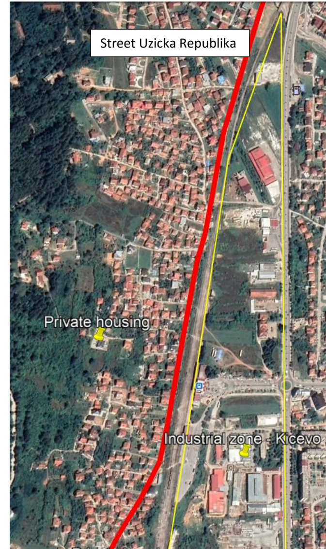
Figure 2 Location of the project site - Street "Uzicka Republika"