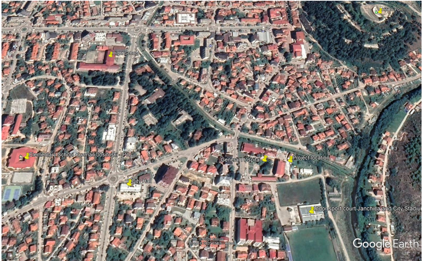
Figure 1 Micro location of the project area in Municipality of Kichevo