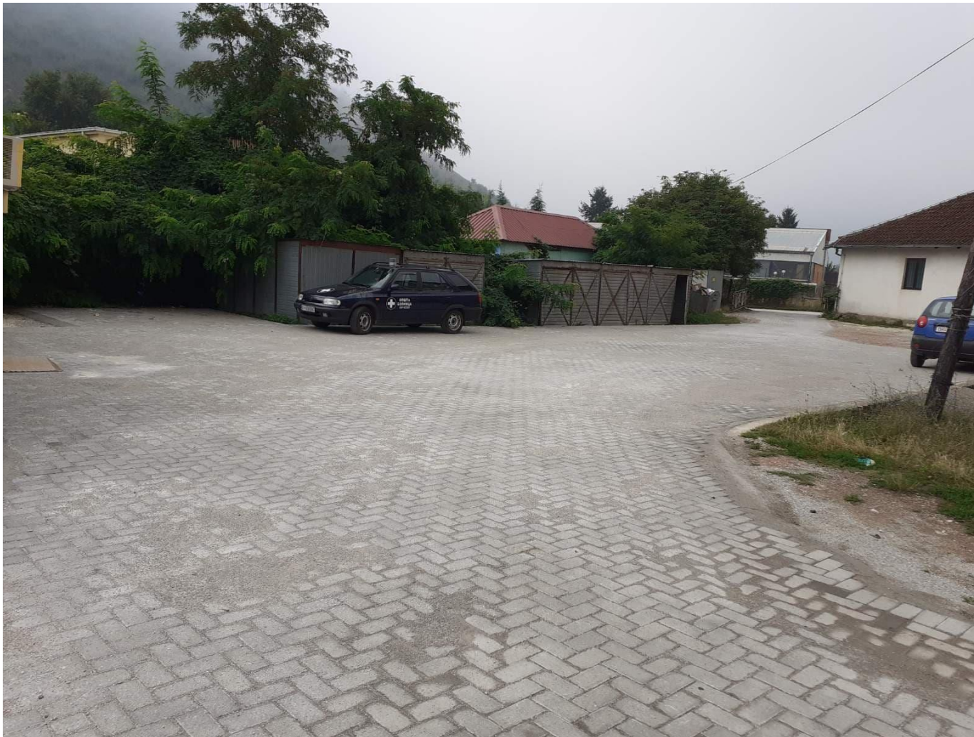
Figure 2 Pictures of the location where the mobile COVID 19 hospital will be installed